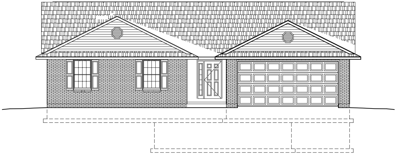
1 FRONT ELEVATION A-1